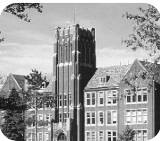
Smyth Hall, Nazareth College

Nazareth College is a private, co-educational college with a liberal arts and sciences core. Founded in 1924 by the Sisters of St. Joseph, Nazareth has been independent for more than 30 years.