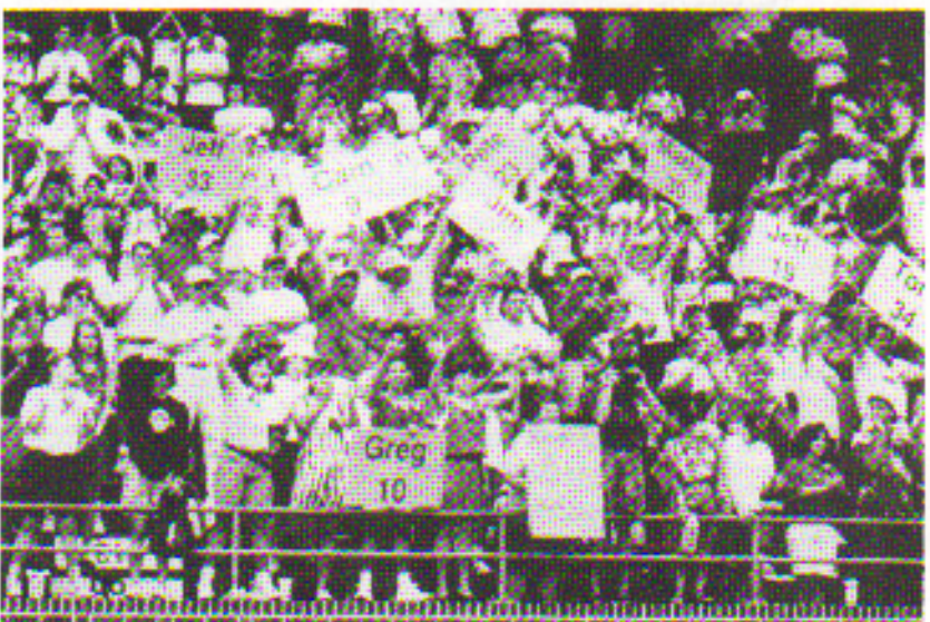
More than 6,700 fans assembled at Franklin Field in Philadelphia to watch Nazareth defeat Roanoke, 22-11, to win the NCAA Division III championship.