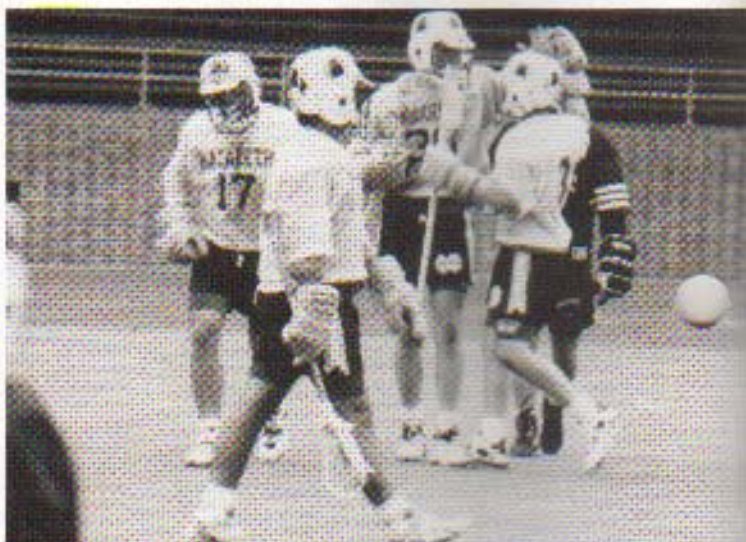
The Golden Flyers celebrate a goal in last year's championship game.