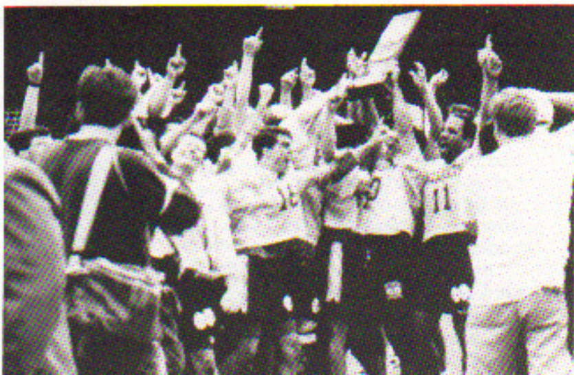
Nazareth's 22-11 victory over Roanoke triggered a memorable celebration.